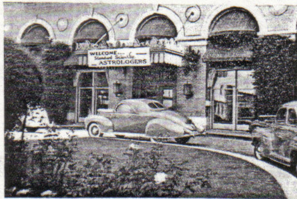
"Welcome Standard Scientific Astrologers," as it appeared over the main entrance of the Hotel Oakland throughout convention there.

San Diego sent a document with official seals, signed by the city mayor, city manager and chairman of board of supervisors, and city and county convention bureau, inviting the Fourth West Coast U. S. Con-